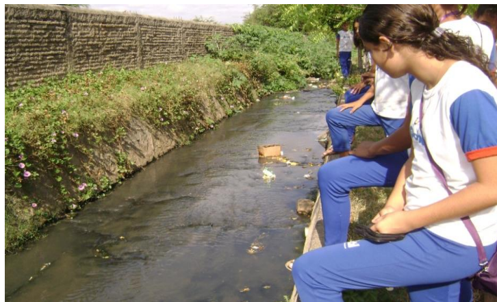
FIGURE 3 - Students on the banks of a canal that empties into the Rio Pianco, Pombal - Paraíba.

Visit the channel aimed to show the reality of the river, where we observed the amount of industrial and domestic waste are thrown into the river daily (Figure 3), moreover, students still found the amount of litter accumulated near the channel (Figure 4) by nearby residents, although there is a regular service of garbage collection in the city.