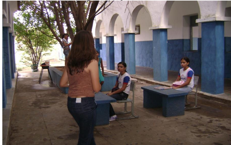
FIGURE 8. The teacher (student) group: "Rational use of water," leads the class on the proposed theme in the play

The other groups have also produced posters and divided between the lines and characters relevant to the topics suggested.