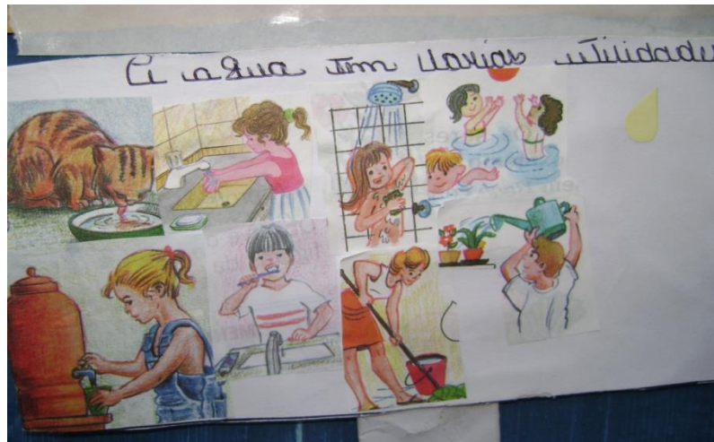
FIGURE 7. Poster group organized by the students: "Rational use of water."

On the topic "Rational use of water", the students organized a poster presentation, Figure 6, and lines between the characters that took place in a classroom, a teacher (student) explaining to the students present on the importance of water and about the need for rational consumption. Figure 7.