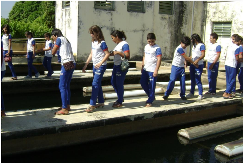
FIGURE 6. Students following the technical and observing the phases of water treatment.

Finally, the fifth work activity, students were divided into 5 groups of 8, to organize plays, with the help of art teacher, to present, with the following themes: Rational use of water and its effects on the environment, irrational use of water and its impact on the environment, distribution of water on the planet, the importance of the hydrological cycle and water pollution. The students were