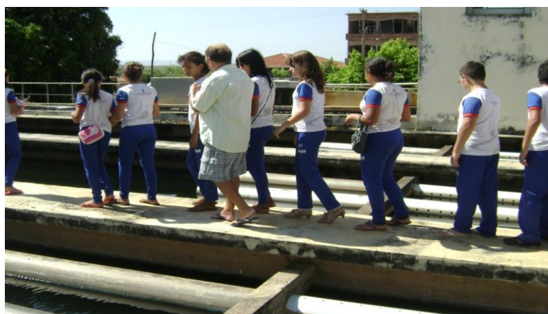
FIGURE 5. Visit CAGEPA. The students were accompanied by an officer who explained all the stages of water treatment undertaken by the company.

taken during the explanations. It was noted that they followed the course indicated by listening to the explanations carefully. Figure 5.