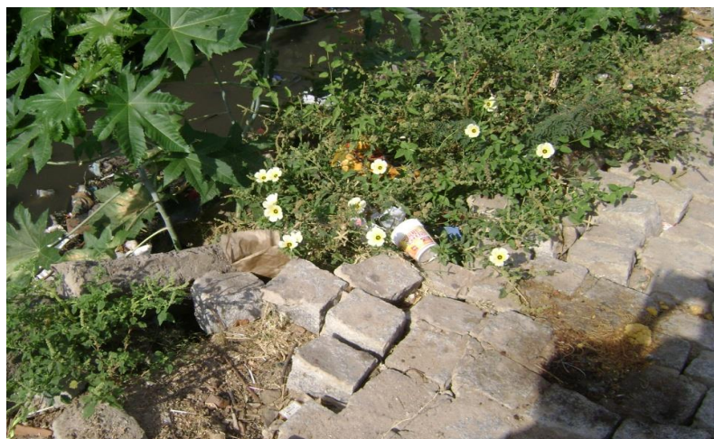
FIGURE 4. Garbage dumped the banks of the canal, as plastic bottles, bags, plastic cups.

the process of environmental education learning and communication problems related to the interaction of men with their natural environment. It is the instrument for forming an awareness through knowledge and reflection on the environmental. (COSTA, 2004), a participatory process through which individual and collective social values construct ... (MOTA and AQUINO, 2003).