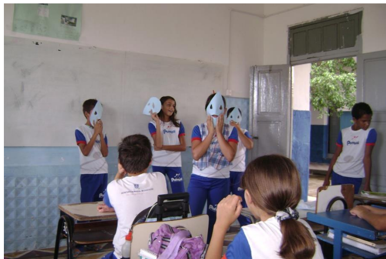
FIGURE 9. Presentation of the group "The importance of the hydrological cycle."

role as an element of the cycle, showing the operation thereof, as well as its importance. The group produced light blue cardboard masks in droplet model to use during the presentation. Figure 9