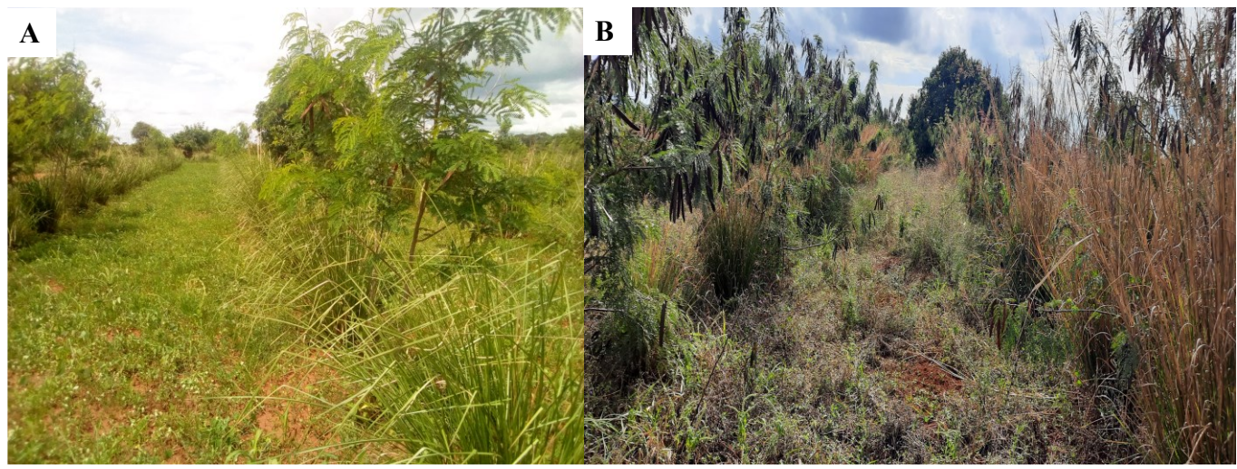
Figure 6. Development of leucaena (A) and vetiver (B) five years after planting (2023).