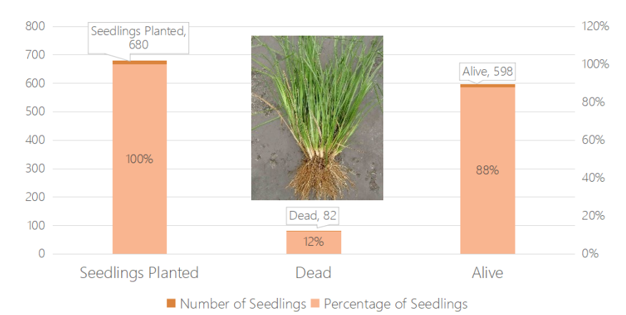
Figure 4. Evaluation of vetiver seedling survival in the field (number of seedlings and percentage).

The leucaena seedlings exhibited slow growth with yellow-green leaves, indicative of nutrient deficiencies in N, P, K, Ca, and Mg. Nitrogen (N) deficiency was characterized by the replacement of green color with yellow-green color in the leaves and reduction in leaflet size. Signs of phosphorus (P) deficiency included reddish coloration on the lower parts of the older foliage and leaf loss. Regarding the effects of