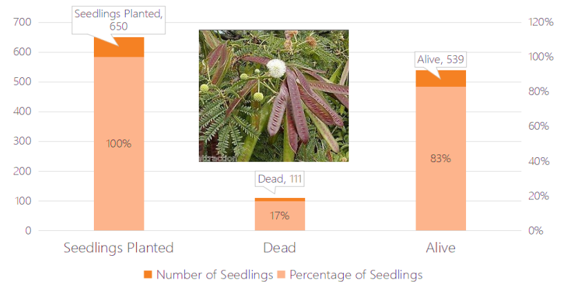
Figure 3. Evaluation of leucaena seedling survival in the field (number of seedlings and percentage).

potassium (K) excess, they were not noticeable, as they should have caused rusting on the leaves and fruits, which was not observed. Low levels of calcium (Ca) were manifested by stunted growth and dying plants. Along with other nutrients, magnesium (Mg) exhibits similar attributes, and in this study, its deficiency was noticeable with the appearance of coloration and shedding of lower leaves in leucaena (Figure 5A).