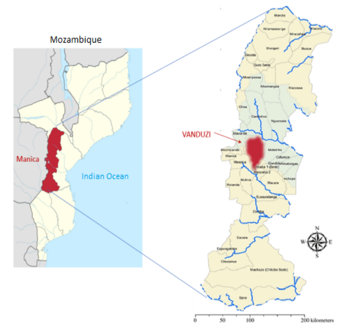
Figure 1:Mozambique, showing the province of Manica (left) and the district of Vanduzi.

combined to form a single composite sample (approximately 300g). Subsequently, the composite sample was homogenized, and an aliquot was taken and sent to the laboratory for analysis.